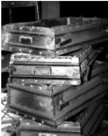
Stack of mold jackets (above), lined with Transite HT. Molds at shake-out with Transite HT bottom boards (top right). Large shell core machine with Transite HT plate (right and below).

Structural High Temperature Insulations for Foundries